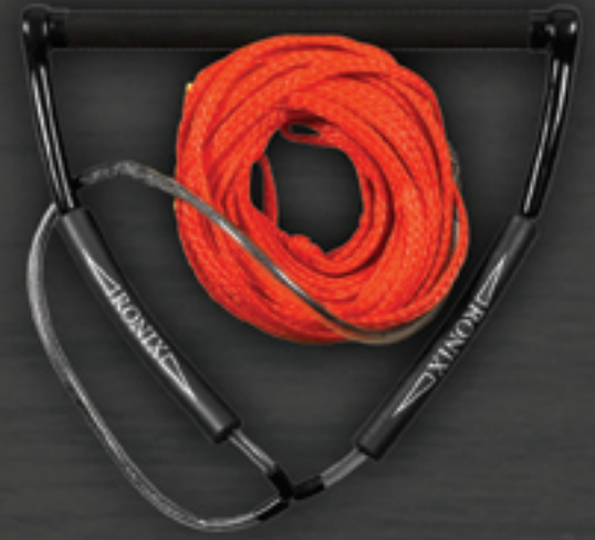
Prequel Handle/TPR Grip/PE Mainline (Assorted colors)