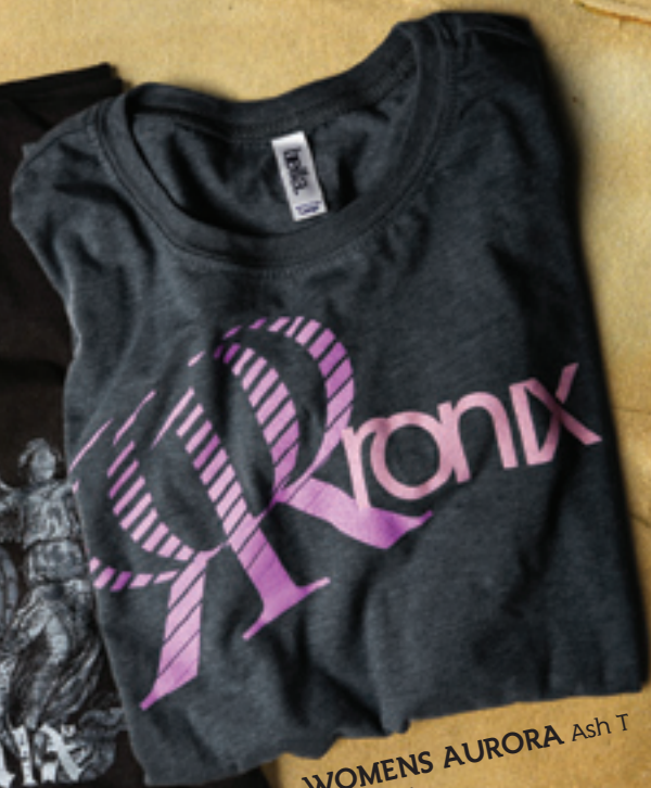
WOMENS AURORA Ash T Sizes S-XL