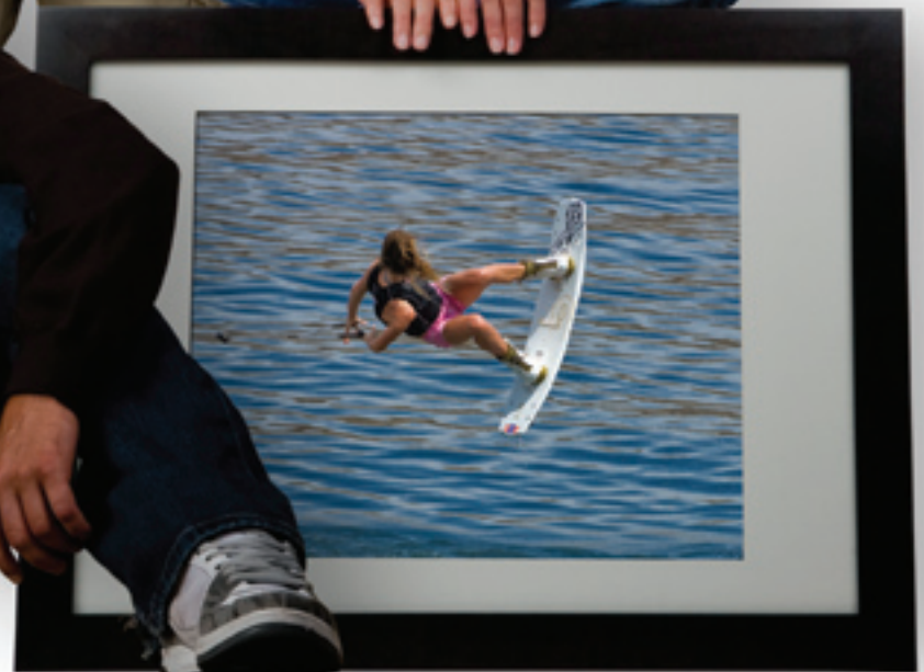
4 Founders, Designers, Owners and Riders