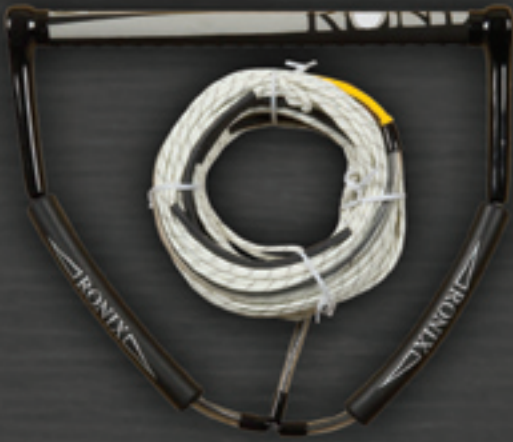
Prequel Handle/Szeto Blend Grip/Core Mainline