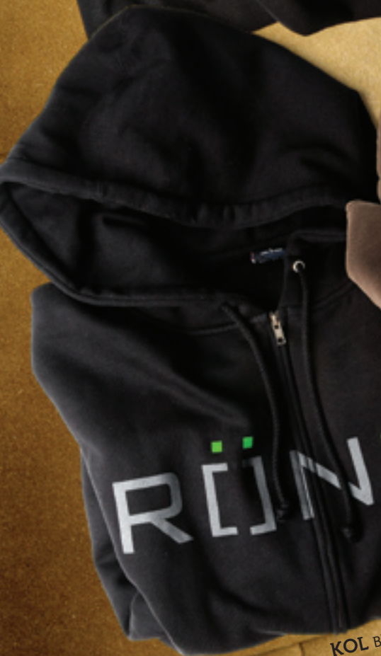
KOL Black Zip-Up Sizes S-XXL