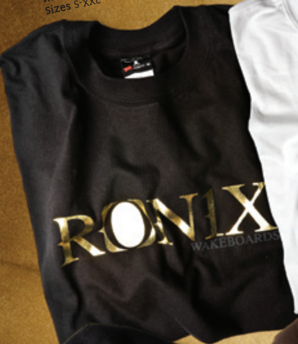
ICON White T Sizes S-XXL