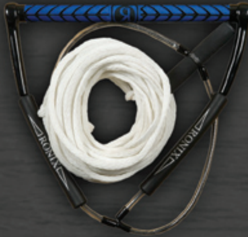
Prequel Handle/Chefs EVA Grip/PE Mainline also available in a double "T" handle (Assorted colors)