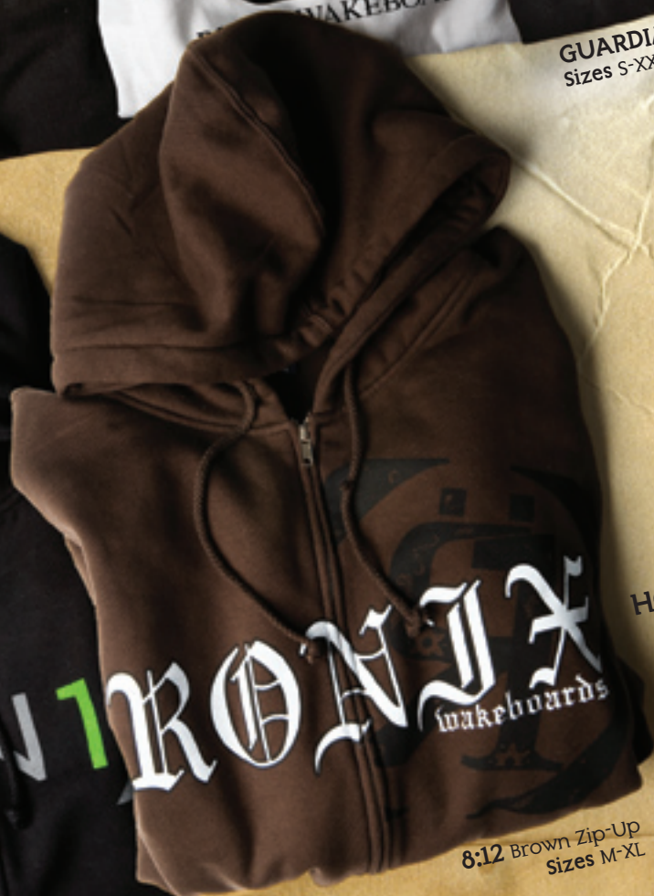
8:12 Brown Zip-Up Sizes M-XL