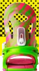
TITAN Line TITAN RK